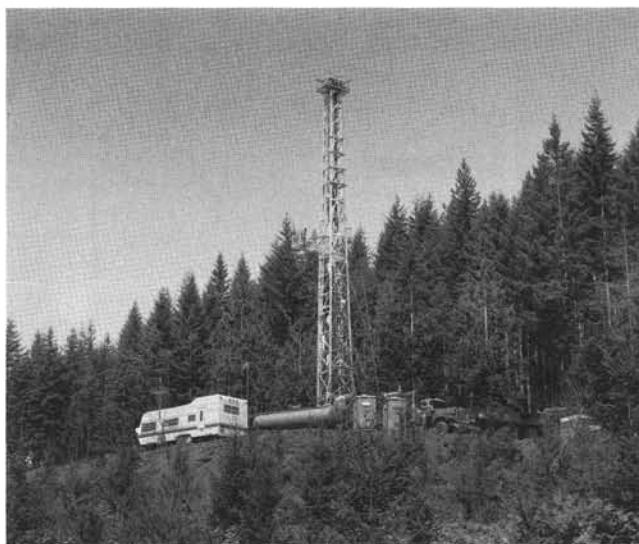
Drilling operations at ARCO Columbia County 14-23, which was successfully completed as a gas producer in 1986.