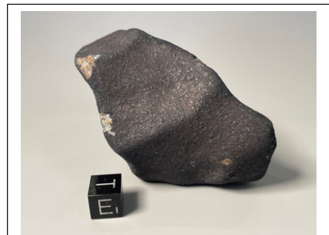
Figure 2. The Great Salt Lake meteorite.

References: [1] Fries, M.D. LPS LIV Abstract #2806 [2] Meteoritical Bulletin , No. 111 (2023).