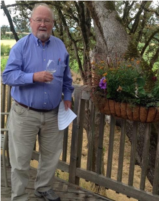
Two stalwart oaks