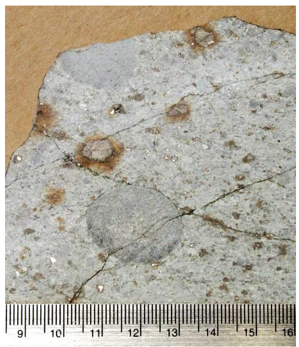
A photograph of a slice of NWA 4859 showing a large round inclusion ~ 2 cm across.

We try to get undergraduate students involved in classification of chondrites as a way of introducing them to the subject of meteorites.