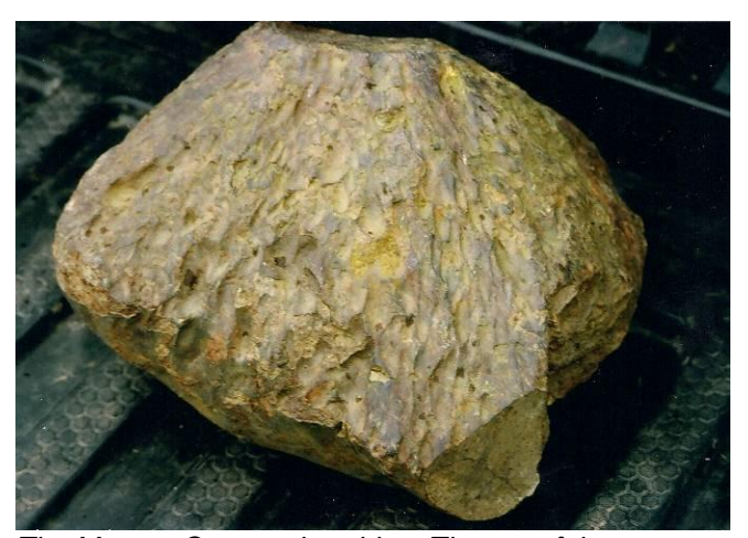
The Morrow County chondrite. The top of the cone was apparently knocked off by a plow, and there are at least three scars indicating the meteorite was hit repeatedly by plows before being thrown into a ditch alongside the road where Mr. Wesson found it. A cut face in the lower right is where a sample was removed for testing. The center of the cut face shows an elaborate dark shock vein.

The name (Morrow County) and the classification have just been approved by the Nomenclature Committee of the Meteoritical Society.