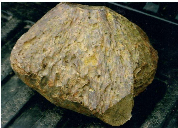
A closer view of the Morrow County meteorite, showing the sculpted surface texture caused by passage through the Earth's atmosphere. The meteorite has a distinctive yellowish color caused by mild weathering on Earth. A portion of the meteorite at bottom right has been removed for study. At the top, another portion is missing, which was removed before Mr. Wesson found the rock, possibly by a farm plow